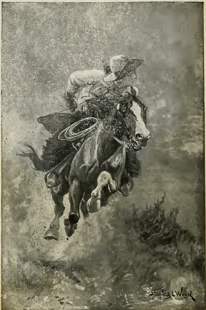
As he raced over the uneven prairie he fumbled with the saddle string. FRONTISPIECE. See Page 83.